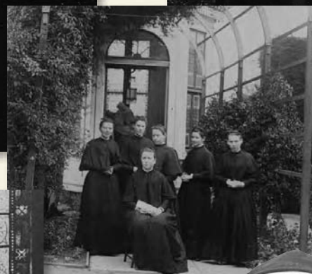
California postulants gather outside the Sacred Heart convent, Oakland, 1894