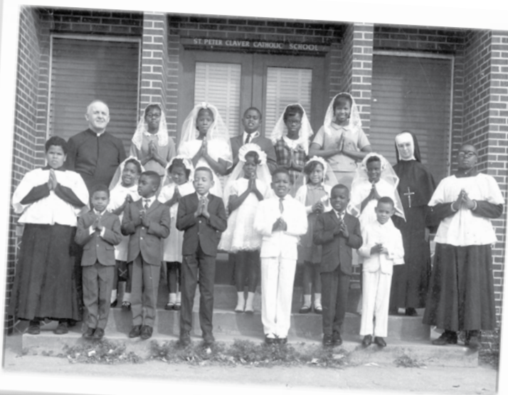
First Communion class, St. Peter Claver, Tampa, c. 1965