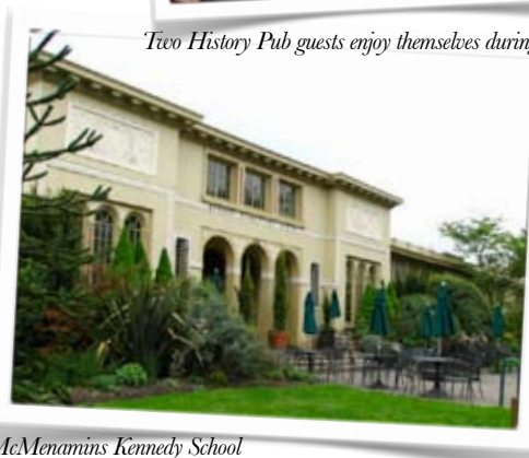
McMenamins Kennedy School

The series is held at the historic McMenamins Kennedy School in Northeast Portland. Where else can you hear fascinating history while enjoying a slice of pizza and a frosty pint of handcrafted ale? History Pub appeals to a broad and diverse audience and is also a family-friendly event. This innovative program typically draws a crowd of 150 people each month.