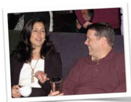
Two History Pub guests enjoy themselves during intermission

Developed by Holy Names Heritage Center, History Pub is a collaborative program of the Heritage Center, Oregon Historical Society, and McMenamins. Each program features a presentation by a humanities expert from fields including history, journalism, law, and women's studies. Whenever possible, individuals who participated in or were affected by the events share their memories as part of the program. The voices of actual historical participants add a unique perspective to the discussion of these important issues.